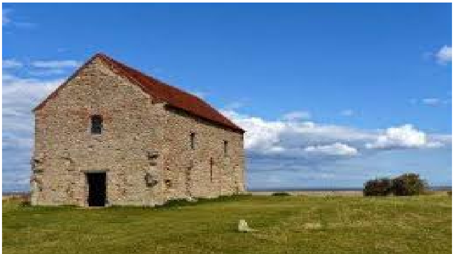
Chapel of St. Peter-on-the-Wall, Bradwell on Sea, Essex